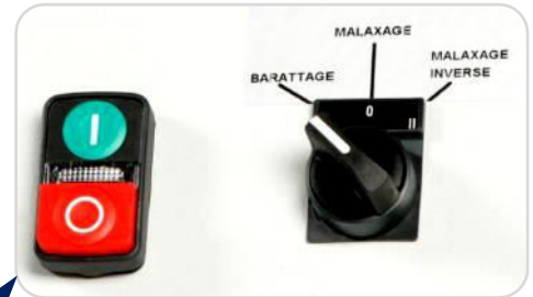
COMMAND BOARD REMOTE function switch CHURNING / KNEADING